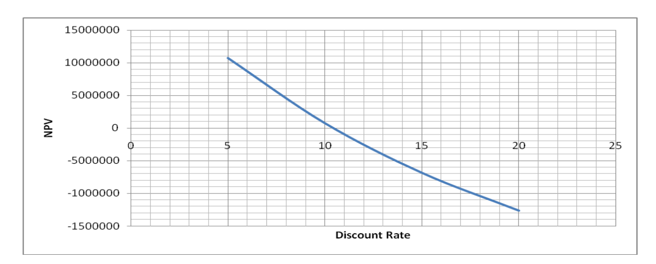
Fig. 3 Plot of NPV against Discount rate, reservoir Z-16RS